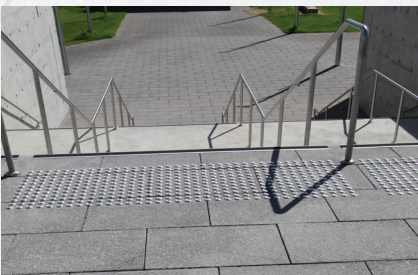
Charcoal Quartz 600x400x60mm