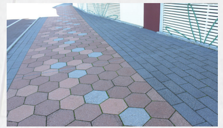
Quartz Hexagonal 60mm