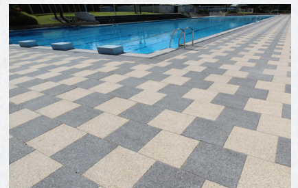
Ice & Charcoal Quartz 400x400x40mm