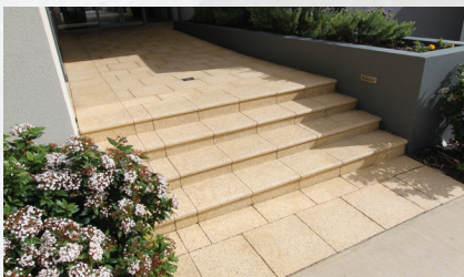
Sandstone Quartz 400x400x40mm