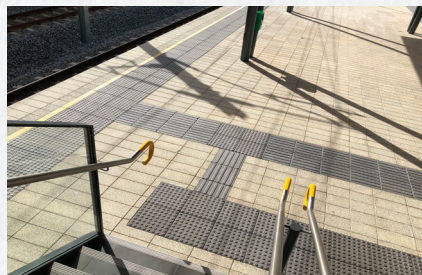
Hazard & Directional Tactiles 400x400x60mm