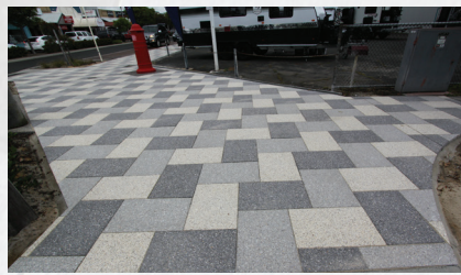
Ice, Greystone & Charcoal Quartz 600x400x60mm